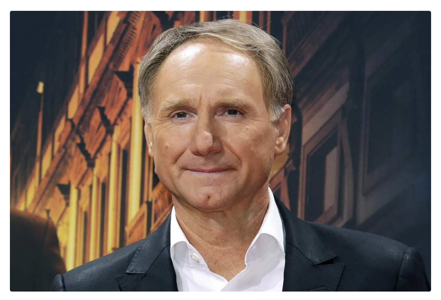
'Da Vinci Code' author settles lawsuit alleging secret life