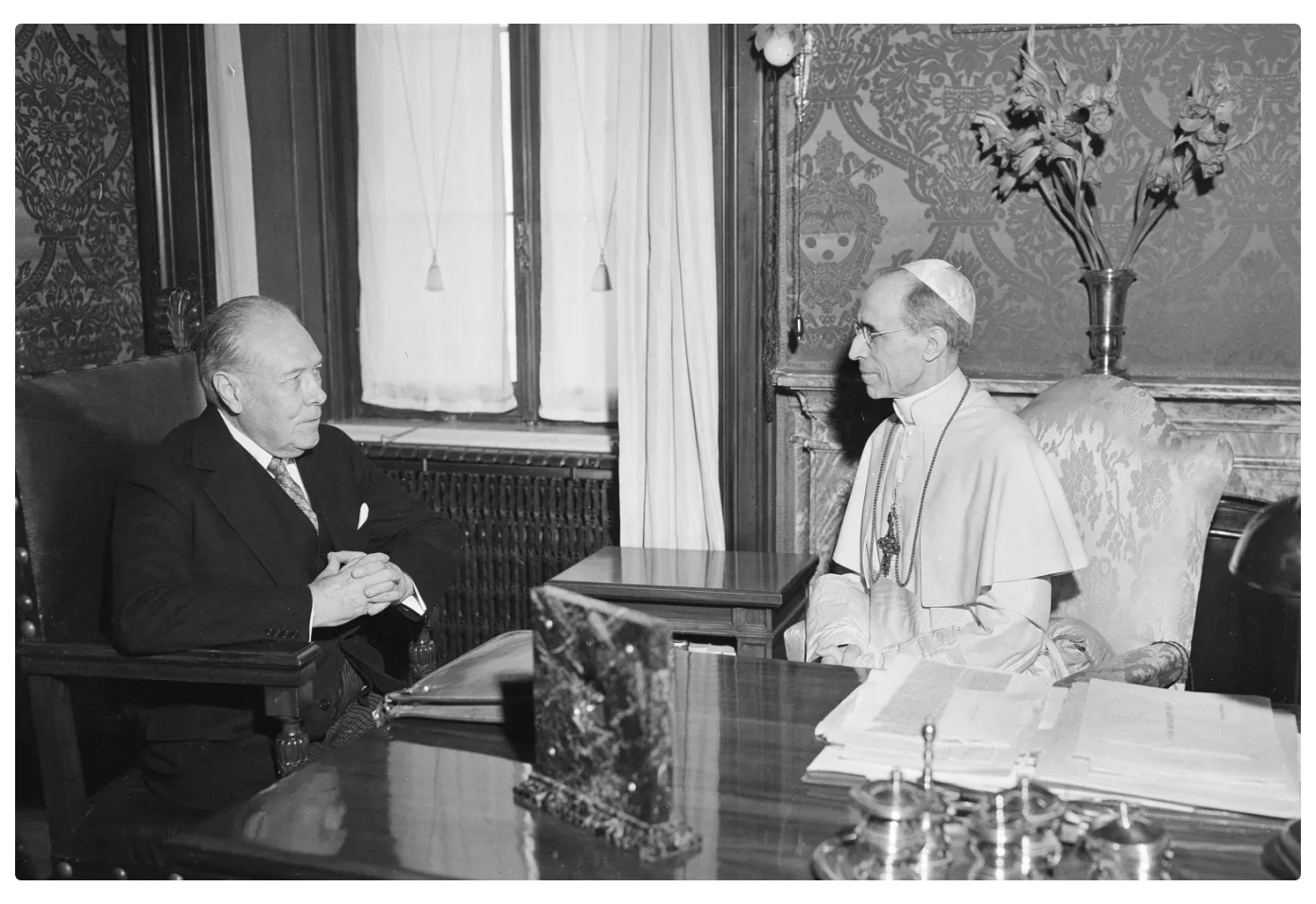
Vatican's Pius XII archives begin to shed light on WWII pope